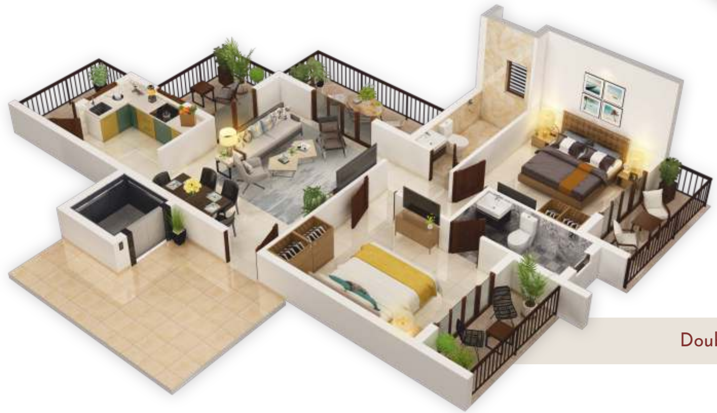
Double Bedroom 3D view