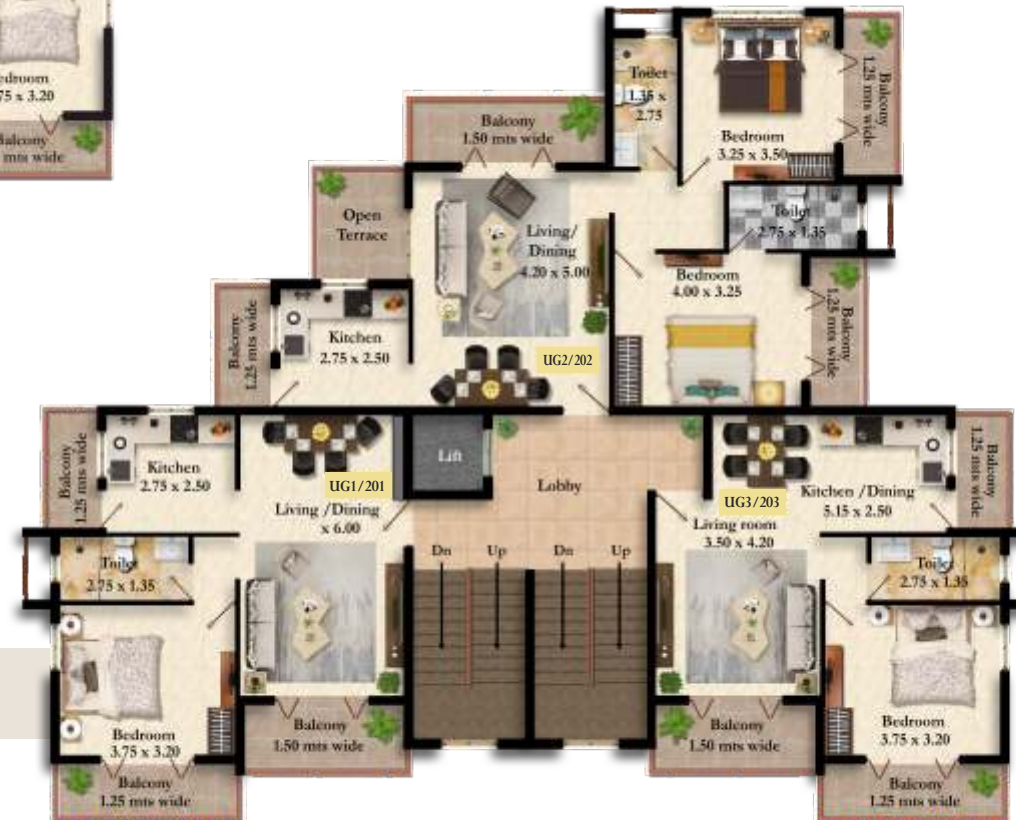
Typical Upper Ground & Second Floor