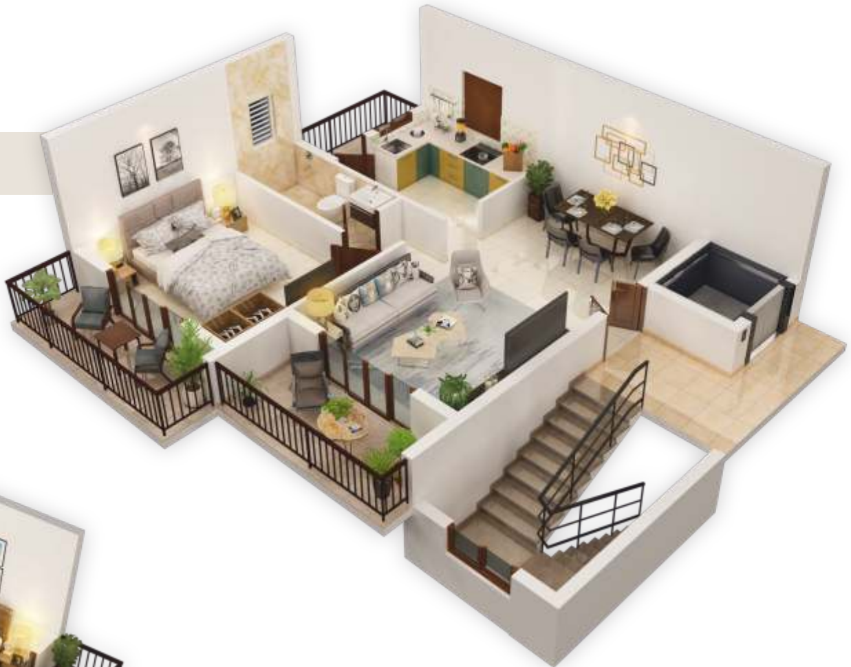
Single Bedroom 3D view