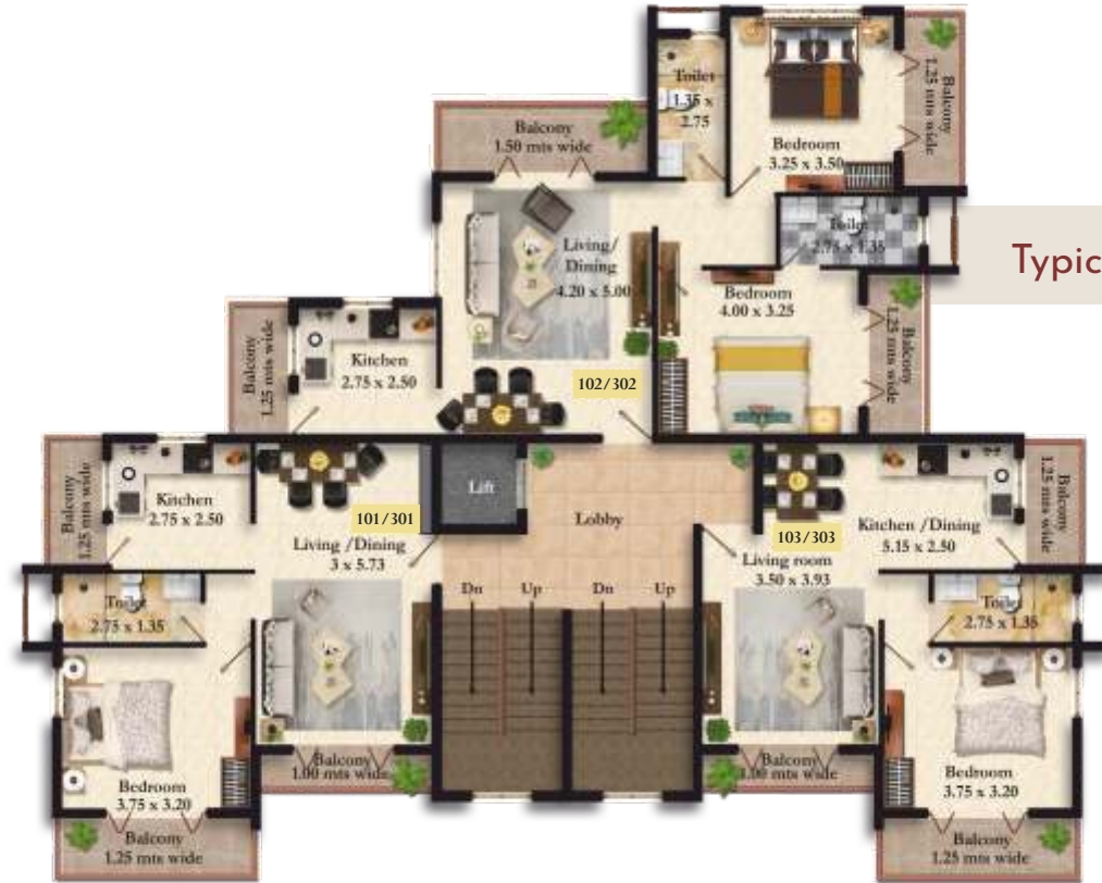
Typical First & Third Floor